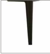
metal leg different metal colours