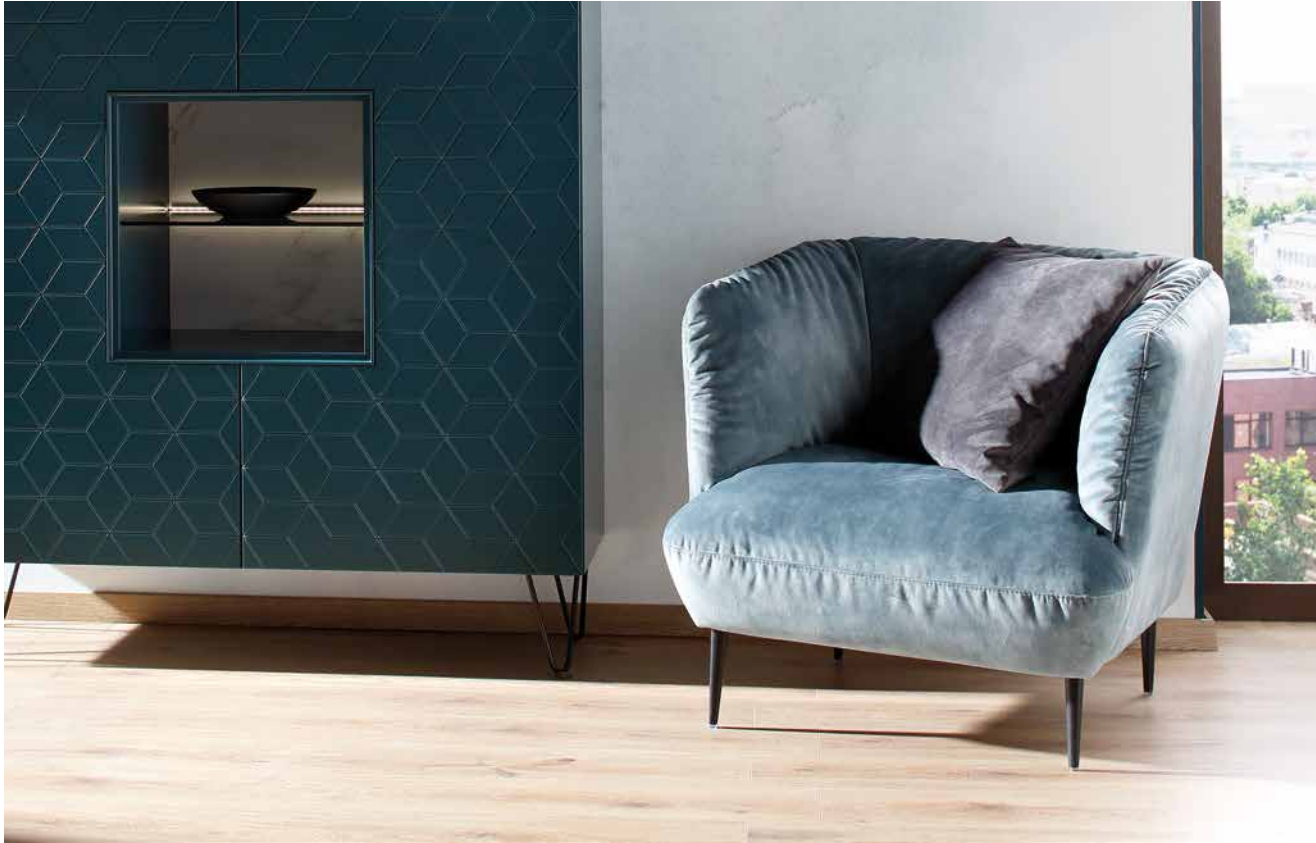
Cover: S41/26 niagara